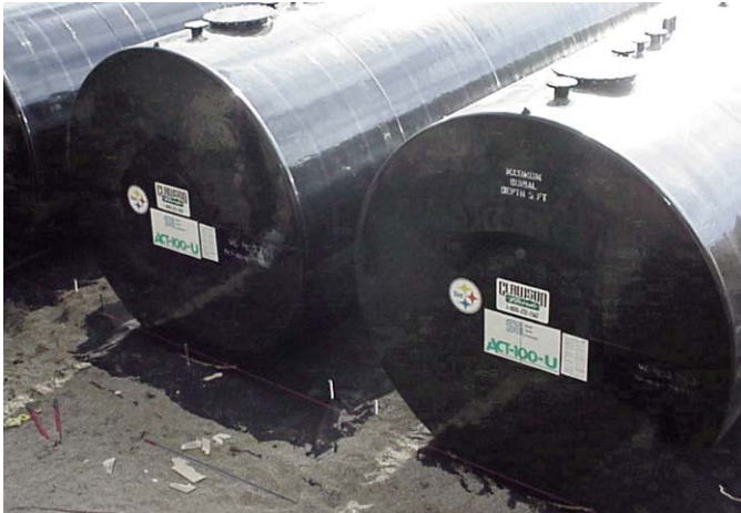
Single or double-wall construction available

ACT-100-U ® tank features a strong inner steel tank for structural integrity, and a thick urethane outer coating for long-lasting corrosion protection. The ACT-100-U ® provides a barrier from corrosion comparable to a fiberglass reinforced plastic coated (composite) steel tank.