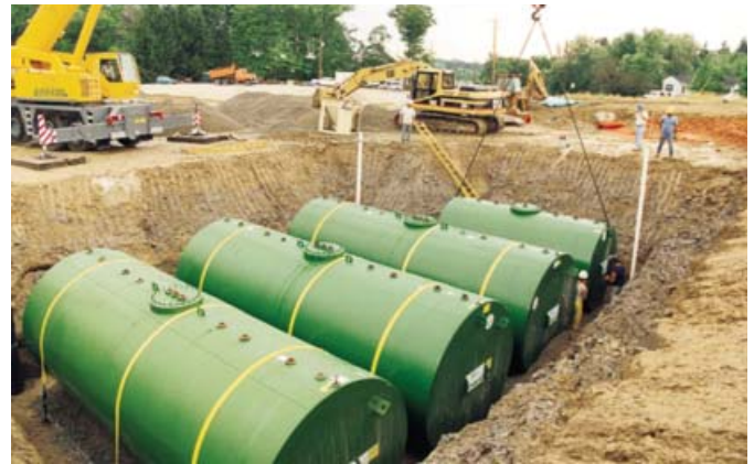
Compatible with a wide range of fuels and chemicals, including biodiesel and ethanol

PROTECT THE ENVIRONMENT. BUY RECYCLABLE STEEL TANKS.